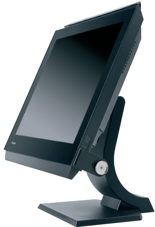
Countertop configuration with optional stand.