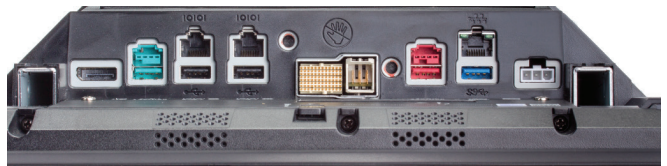
Selectable and upgradeable SurePorts enable retailers to use existing devices and connect customer or employee devices