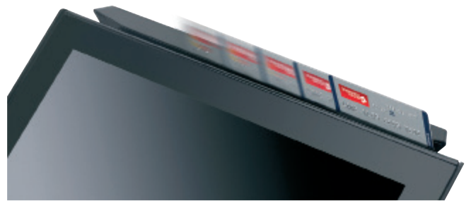
Optional MSR and/or customer display