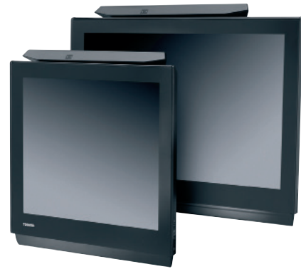
Kiosk configuration landscape viewing