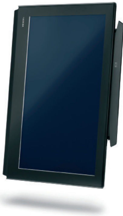
Kiosk configuration portrait viewing