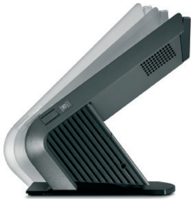
Multiple viewing angles and heights